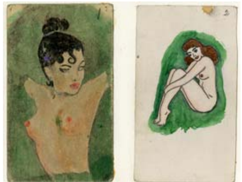
Hand-drawn nude figures from the Private Eyes: Amateur Art from the Kinsey Institute exhibition.

Private Eyes: Amateur Works from The Kinsey Institute Collection explores the unique characteristics of homemade erotic artifacts. These one-of-a-kind items include drawings, paintings, carved figures, handmade cards, scrapbooks, and altered coins from The Kinsey Institute's permanent collection of art. These “artworks” were intended for private consumption and created with specific individuals in mind, unlike mass-produced, commercially distributed pornography.