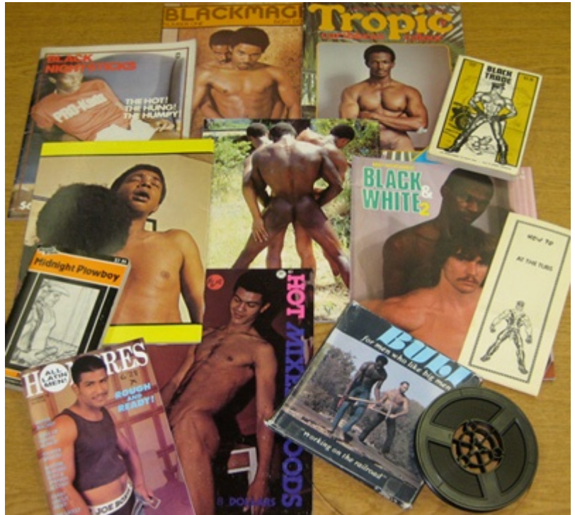
A selection of films, magazines, and text materials from the new Dwoods Black Sexuality Collection, donated to the Kinsey Institute Library in 2009.

To invite further exploration of the collection and to encourage further discussion on the topics of ethnicity and sexuality, The Kinsey Institute will be collaborating with the Black Film Center/Archive at the Herman B. Wells Library on IU's Bloomington campus, to host a conference on black sexuality in 2012.