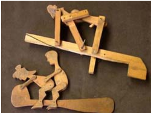
Handmade wooden sex toys from the Private Eyes: Amateur Art from the Kinsey Institute exhibition.

To date, these materials have received scant scholarly or sociological attention, and The Kinsey Institute is displaying the majority of these items for the first time.