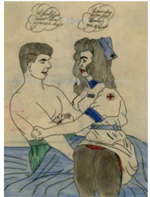
Private Eyes: Amateur Erotic Art from the Kinsey Institute Collections This amateur drawing is one of several in the Private Eyes exhibition currently showing at the Kinsey Institute Gallery. The show features amateur and hand-made art from the collections, most of it being shown for the first time.

Keep up with The Kinsey Institute™ on Facebook, Twitter, and YouTube